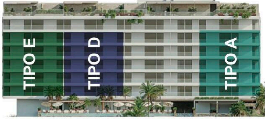
UBICACIÓN EN FACHADA